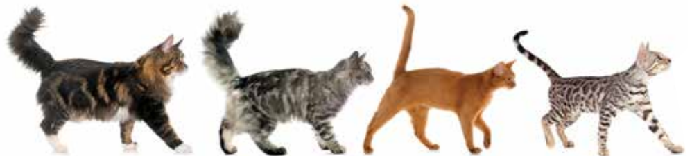
The Maine Coon cat (far left) is bigger than your average house cat.

Be ready to do your research if you believe an exotic cat such as a Maine Coon may be for you. Their needs can often be greater than the average moggy, and it is worth having a discussion with your vet to make sure you're as knowledgeable as possible for the new arrival.